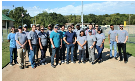
Vizient employee volunteers at Trinity View Park for Community Day

Texas Arbor Day will be celebrated at Barton Elementary on Nov. 11, honoring them for their outstanding recycling and environmental stewardship.