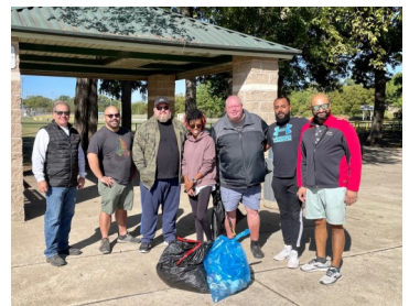
Verizon employee volunteers after their Trinity View Park Cleanup

If you haven't been to the Bird's Fort Trail Park Butterfly Garden, please take the time to visit and see how beautiful it is. Since Jan. 1, volunteers have logged 190 hours of service tending to the garden, which is full of plants that attract butterflies and other pollinators. We hope this inspires you to start your own butterfly garden at home. Even a potted plant on an apartment patio can be a mini-garden, and you might be surprised by who comes to visit!