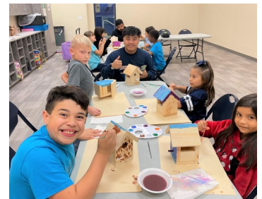
Senter Park Rec Center children painted birdhouses

KIB staff enjoys visiting schools to talk about our programming and volunteer opportunities, and we did just that on Oct. 13. Irving ISD's Cardwell Career Preparatory Center recently joined the Adopt-a-Spot Program, and staff and students were interested in learning more about that program and other ways they could volunteer with KIB. If you, too, would like to have KIB staff present to your school or organization, please call the KIB office at (972) 721-2175.