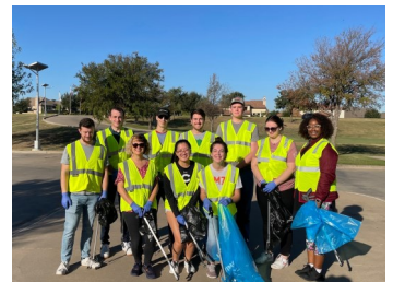
Gartner employee volunteers ready for their Bird's Fort cleanup

We had another cleanup on Oct. 20, this time at Trinity View Park with Verizon employees. KIB has a long history of partnering with Verizon, and we were happy to welcome this enthusiastic group of eight, who gave 16 hours of service at this popular park.