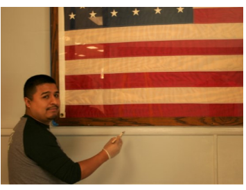
...then Shake Shack volunteers came out on MLK Day to paint the entry area.