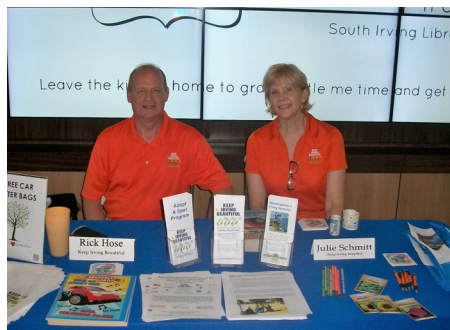
KIB staff recently promoted clean public spaces at the South Library.

There is something for everyone at an Irving Library. Programs like the Summer Reading Challenge, the Big Read and "One Book, One Irving" engage the whole community in reading, and the variety of activities offered is impressive: career advancement/job search advice; meditation and "Color Me Calm" classes; "Conversaciones" English practice; movie nights and book clubs are just a small sampling. And yes, you can check out books, too! The library also offers a large selection of E-books which can be checked out anytime, from anywhere, and participates in the TexShare interlibrary sharing program.