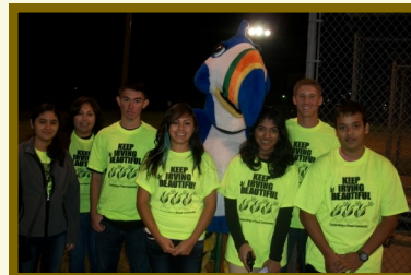
Left: YMCA Fall Festival volunteers with KIB’s mascot, Kirby.