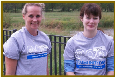
VHA employees enjoyed a day of giving back to the community on October 9

Irving-based VHA, Inc. holds a Community Day every fall where employees participate in service projects with non-profit organizations. In their 4th year to partner with KIB, a group of 23 gave 103 hours of volunteer time to paint the playground area at Running Bear Park