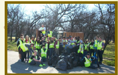
(Right): South Mac Youth Ministry members gather after the Trinity View Park cleanup on February 23.