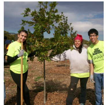
Service Learning students in action at the UPS tree planting at the Mountain Creek Preserve Tree Farm (above), and at the Irving Family YMCA Fall Festival (below).

Think before you throw an item into the trash: Can this be reused or recycled?