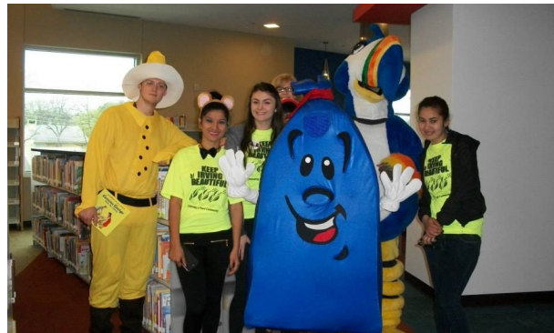
Service Learning students entertained guests by dressing as mascots and literary characters at the South Irving Library Grand Opening on March 21.

During the 2014-15 school year, North Lake students participated in: the Trash Bash and Trash-Off, as well as joining with other groups for cleanups, like the Nimitz FFA at Trinity View and the Irving Lake Association at the annual spring Lake Vilbig cleanup; planting trees at the city of Irving's Tree Farm; several paint projects at Irving parks; the Grand Opening of the new South Irving Library; and community events like the Irving Family YMCA Fall Festival, where they worked the KIB table and prize wheel and made it a green event by collecting recyclables and keeping the grounds litter-free. KIB tried to offer as many different and interesting opportunities as possible with a variety of partners to engage the students in meaningful volunteer community service.