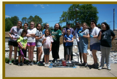
Girl Scout Troop 2871 in front of their paint project at Running Bear Park.