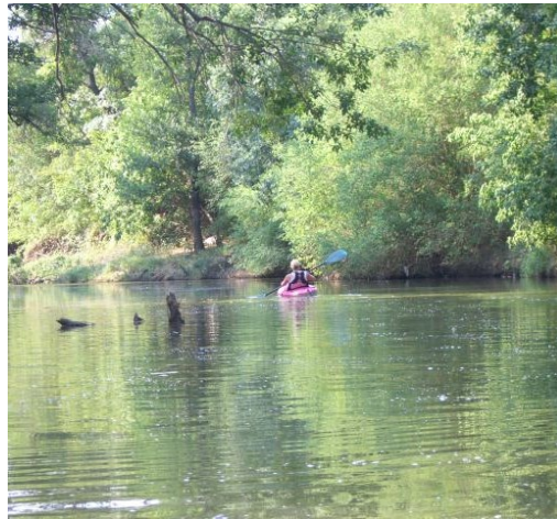
A kayaker enjoying a beautiful day on the Elm Fork of the Trinity River

A great source of information on water usage is our own City of Irving Water Utilities Department. Their page on the city's